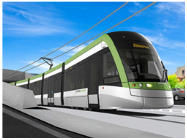
Ealinton Crosstown LRT

As we redevelop sites, we are designing pedestrian-friendly sites, with generous open spaces and bike lanes. These people-oriented communities are built and operated with a focus on resiliency, inclusive of the site's infrastructure, occupant health and safety and resource efficiency. As municipal transit plans evolve, we prioritize intensification of sites in close proximity to higher order transit. For example, the new Eglinton Crosstown LRT will improve the transit connectivity of three of our properties in the Greater Toronto Area, with LRT stops being built directly on, or adjacent to, our properties.